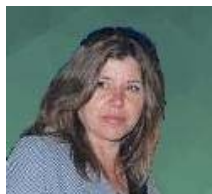
Executive Director Canadian Financial Executives Research Foundation (CFERF) t (416) 366-3007 f (416) 366-3008