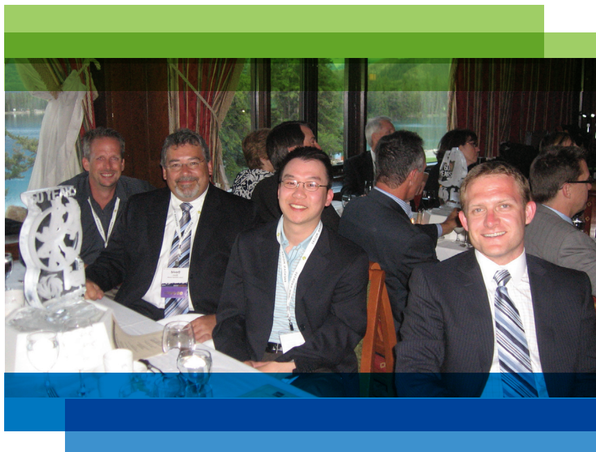
ANNUAL NATIONAL CONFERENCE