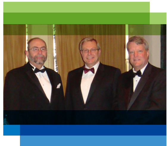
CANADA'S CFO OF THE YEAR™ GALA

Sponsored by FEI Canada with its presenting co-sponsors PricewaterhouseCoopers LLP and The Caldwell Partners International, Canada's CFO of the Year™ Award is given annually to an individual who has made an outstanding contribution to business in Canada through vision and leadership, corporate reporting and performance, social responsibility, innovation, and business complexity.