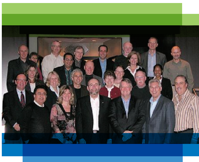
FEI CANADA VOLUNTEER LEADERSHIP

FEI Canada is growing and our network is getting stronger as members from across Canada and across industry lines come together to share information, best practices and influence regulatory change.