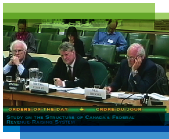
FEI CANADA TESTIFIES BEFORE THE HOUSE OF COMMONS STANDING COMMITTEE ON FINANCE

If you would like to join IPAC, or would like further information on recent IPAC activities, please visit www.feicanada.org/committees.html