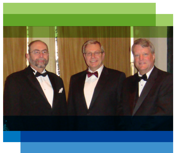
CANADA'S CFO OF THE YEAR™ GALA

Sponsored by FEI Canada with its presenting co-sponsors PricewaterhouseCoopers LLP and The Caldwell Partners International, Canada's CFO of the Year™ Award is given annually to an individual who has made an outstanding contribution to business in Canada through vision and leadership, corporate reporting and performance, social responsibility, innovation, and business complexity.