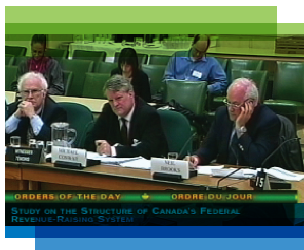
FEI CANADA TESTIFIES BEFORE THE HOUSE OF COMMONS STANDING COMMITTEE ON FINANCE

If you would like to join IPAC, or would like further information on recent IPAC activities, please visit www.feicanada.org/committees.html