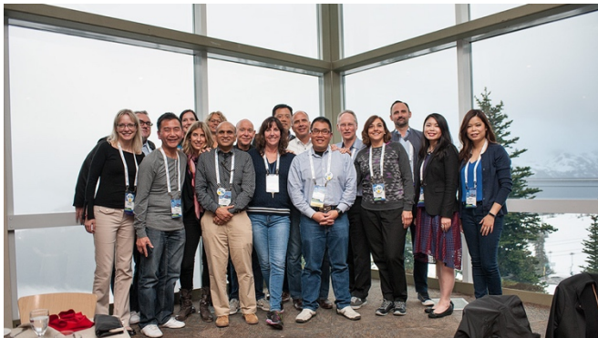
Gala Dinner in the Roundhouse on top of Whistler Mountain – Vancouver chapter members