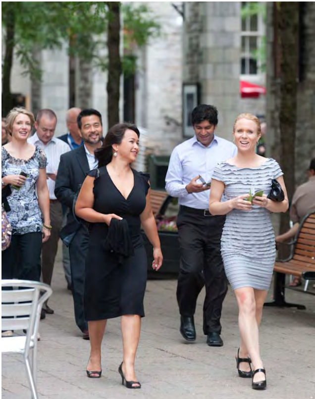
Attendees from Vancouver walking between restaurants at the Gala evening.