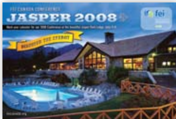
FEI Canada National Conference 2008, Jasper, Alberta