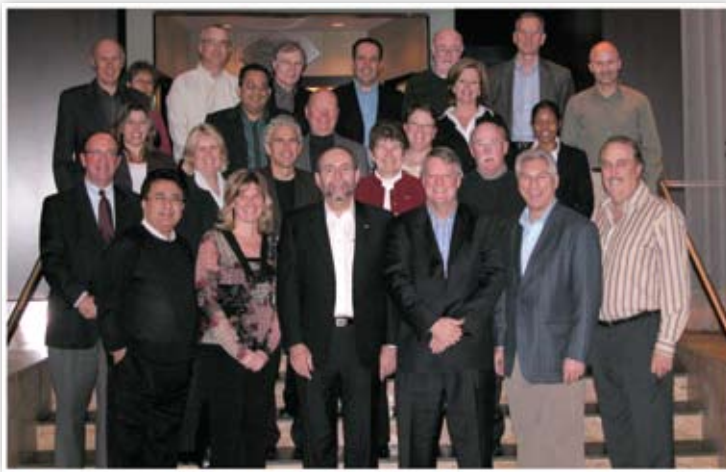
The National and Chapter leadership met in November 2007 to plan the future strategic direction of FEI Canada.